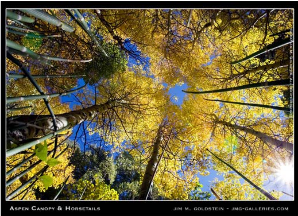
ASPEN CANOPY & HORSETAILS